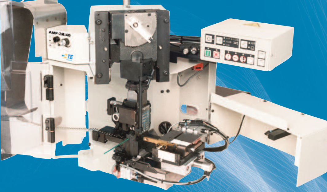
Stripping Module shown on the AMP 3K/40. Guards are open for clarity.